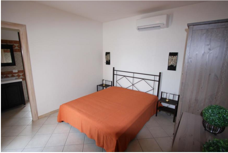
Bed room 1