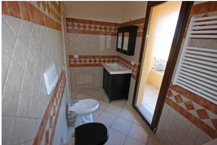
Bath room 1 with washing machine