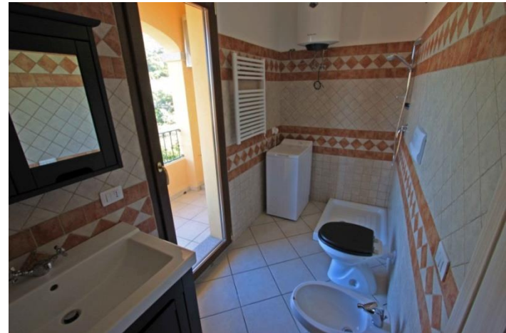
Bath room 2